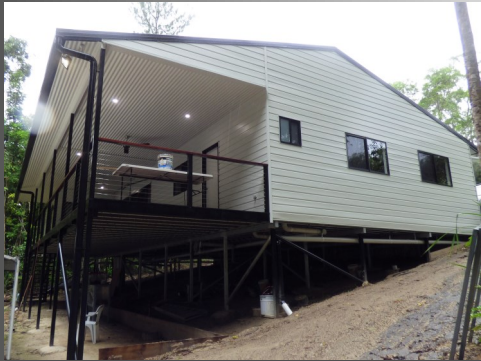
Ideal for Sloped Blocks