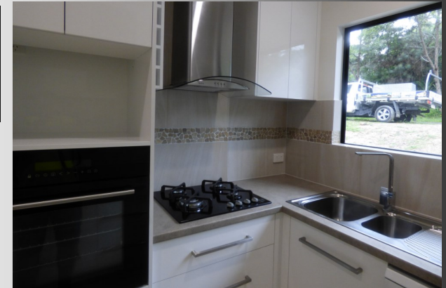
Modern Kitchen Appliances