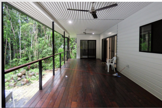
Enjoy outdoor living